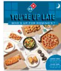
You're Up Late