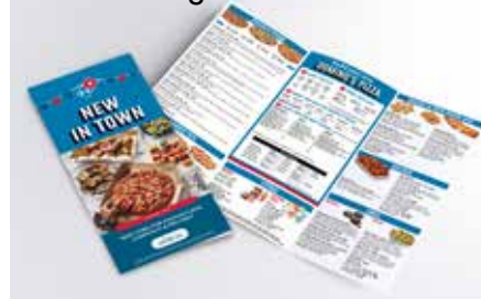
EDDM Savings Menus