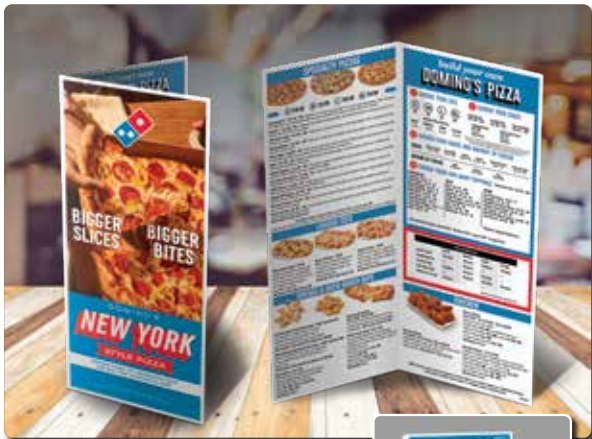
60# Gloss, 9 1/2"x11" Flat, folds to 4 3/4"x 11", 2 sided