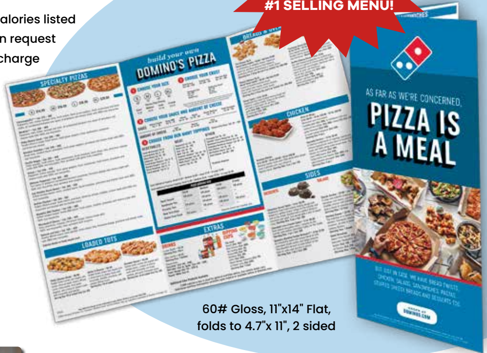
60# Gloss, 11"x14" Flat, folds to 4.7"x 11", 2 sided