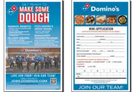
60# Offset, 5.375" x 8.5", 2 sided