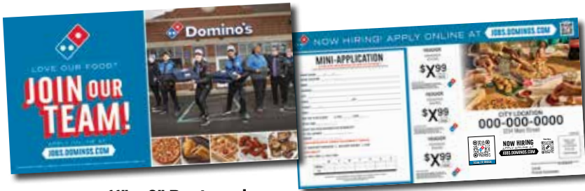
11" x 6" Postcards