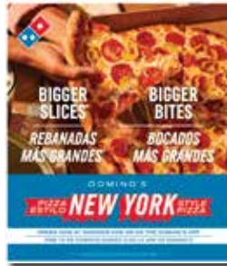
Domino's New York Style Pizza Bil