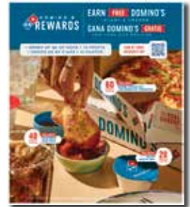
Domino's Rewards Dec 23 Bil