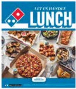
Let Us Handle Lunch