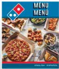
Corp Generic Menu Bilingual