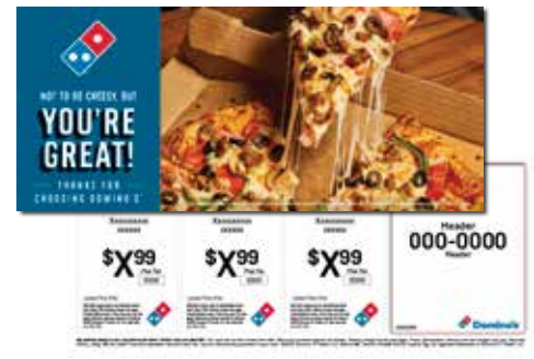
Pop Up Cards

Small quantities, standard 5-7 day turnaround after art approval.