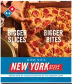
Domino's New York Style Pizza