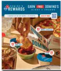
Domino's Rewards Dec 23