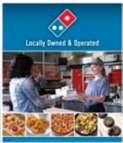
Locally Owned & Operated