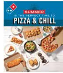
Pizza & Chill