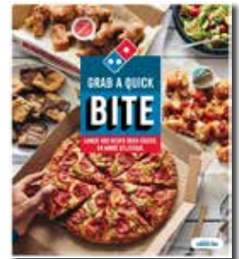
Grab A Quick Bite