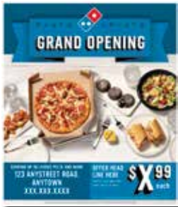
Grand Opening with price point