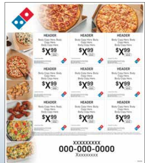
60#, 9.5" x 11", 2 SIDED