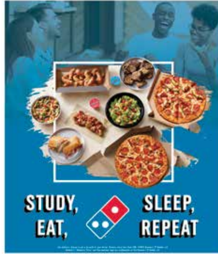
Study Eat Sleep Repeat!