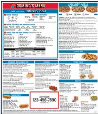
60#, 9.5" x 11", 4/0 Color